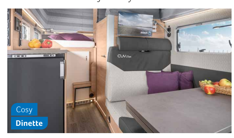
500 MQ. The modern interior design in the TOURER CUV creates a cosy atmosphere, with plenty of space for the whole family.

A flexible family vehicle while commuting, a junior suite while on holiday: The TOURER CUV is waiting to share your adventures. The CUV is special model is jam-packed with features and will save you a sensational amount of money.