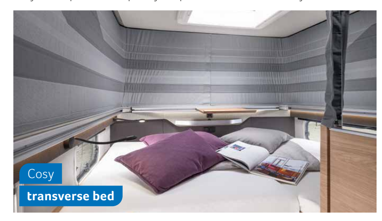
500 MQ. The rear transverse bed extends across the entire width of the vehicle. The pop-up roof material is breathable.