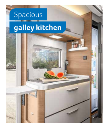
640 MEG. A quick snack or a big meal – anything goes here.