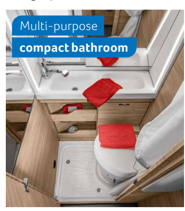
540 ROAD. Well thought-out down to the tiniest detail. Typical of our camper vans.