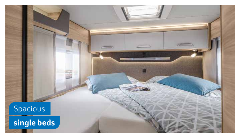
650 MEG. The additional vent window and bed extension make the sleeping area a real haven of relaxation.