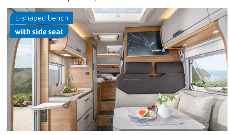
640 MEG. Enjoy plenty of legroom in the seating area featuring a height-adjustable pedestal table and exclusive VANSATION embroidered logo.

Thanks to its innovative FoldXpand rear design & VW Crafter chassis, the VAN TI offers the same interior space on a shorter body. The VANSATION special model boasts a number of highlights and is available at a special price.