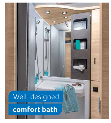
650 MEG. The comfort bath boasts a well-lit mirror and numerous shelves.