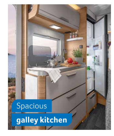
650 MEG. The two-burner hob and large refrigerator mean you have everything you need for cooking.