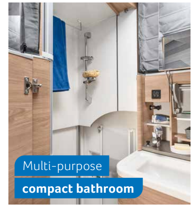
500 MQ. The innovative Xpand bathroom – a big solution for a compact space.