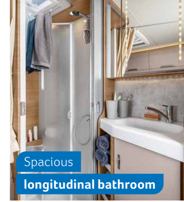
550 MF. The longitudinal bathroom boasts a separate shower and large washbasin.