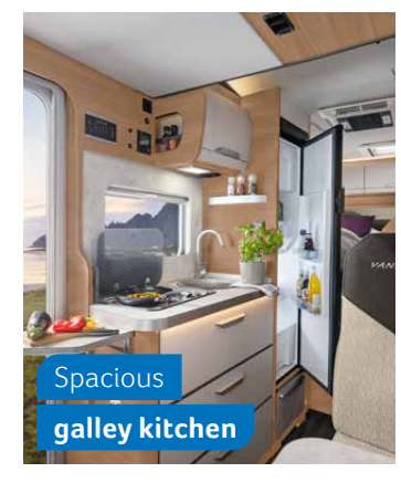
640 MEG. Make the most of the spacious galley kitchen with plenty of room for cooking.