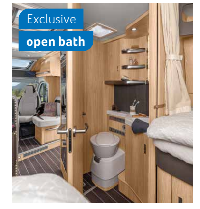
700 MEG. Enjoy plenty of elbow room in the open bath.