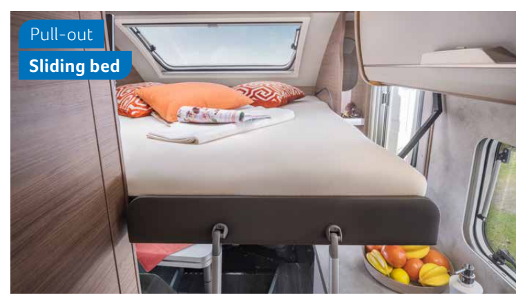
\bf 500~MQ. The optional sliding bed is easy to pull out and offers up to two extra sleeping places at the front.