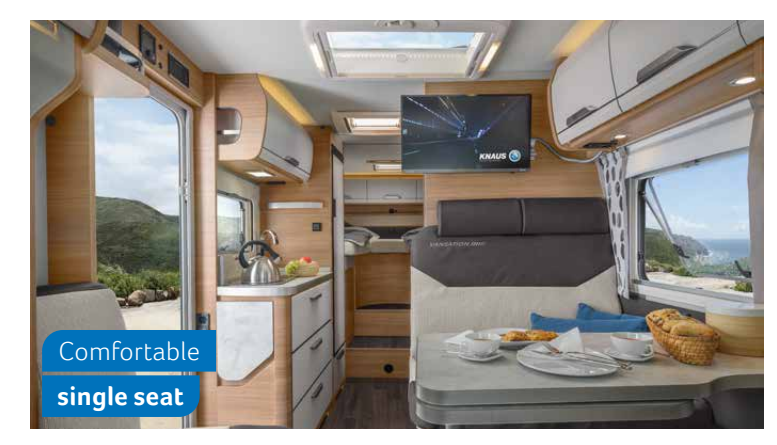
650 MEG. The characteristic VANSATION embroidered logo and COZY HOME package are eye-catching features in your VAN TI.

As a VANSATION special model, the VAN TI offers numerous equipment highlights at an advantageous price. Thanks to the innovative KNAUS FoldXpand rear construction, it also offers the largest living space in its class with unique comfort details.