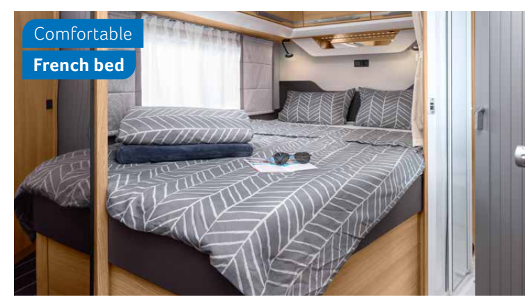
650 MF. The bed extension gives you even more room at the foot of the bed, while the set of fitted sheets is the perfect fit for the beds.