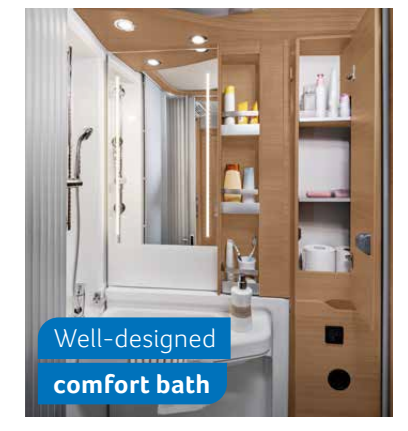
640 MEG. Maximum storage space. Everything neatly and securely stowed away.