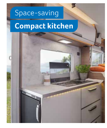
500 MQ. Well organised kitchen unit with a compressor refrigerator facing sideways, a 2-burner hob, a sink and lots of storage space.