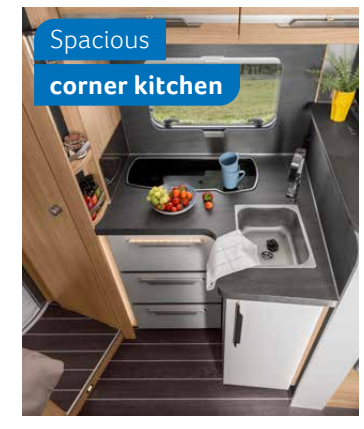
650 MF. Intelligently integrated & plenty of storage space for all your utensils.