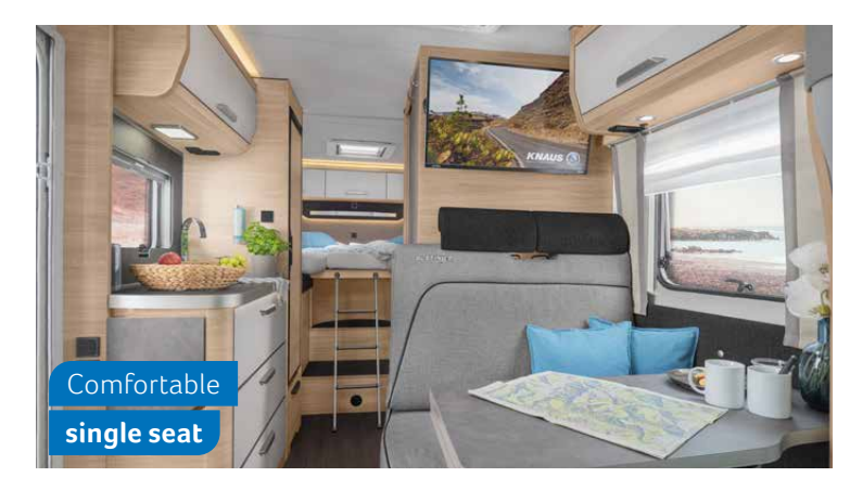
650 MEG. Open lines of sight as well as a bright, welcoming interior create a pleasant atmosphere.

The dynamic all-rounder with that little bit extra. The VAN TI PLUS on VW CRAFTER inspires with unique manoeuvrability, maximum living comfort & a striking PLUS in driving dynamics.