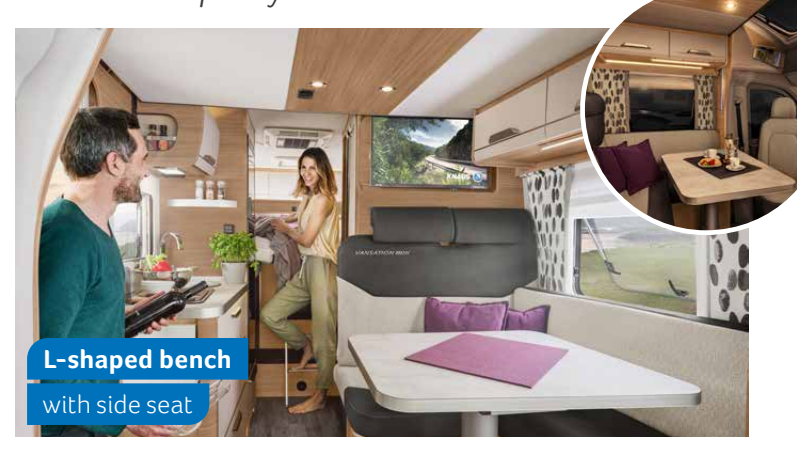
640 MEG. The TV is mounted in such a way that you can enjoy a clear view of it from the seating area or the lifting bed.

The all-rounder with lots of extra features and an exclusive design for a vansational price! In addition to 4 sleeping places, the VAN WAVE offers numerous assistance systems and a supremely smooth ride quality.