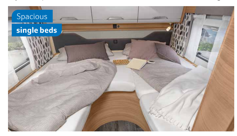
640 MEG. The single beds are not only comfortable to sleep in, but have plenty of storage compartments too.