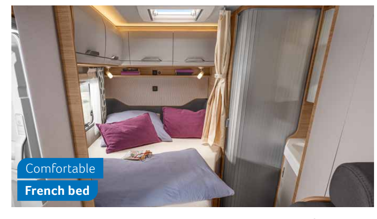
550 MF. The bed extension gives you even more room at the foot of the French bed.