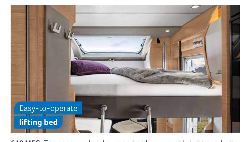
\textbf{640 MEG.} \ The generous headroom and wide, removable ladder make it incredibly easy to get in and out of the lifting bed.