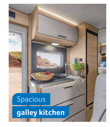
650 MEG. The kitchen has everything future Michelinstarred chefs need to get creative.