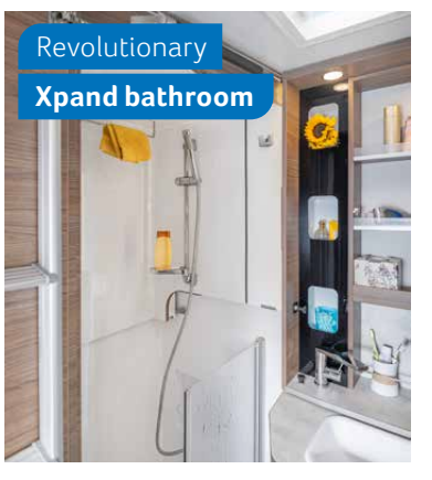
500 MQ. When fully extended, the shower is spacious and the rest of the room stays dry thanks to the watertight shower screen.