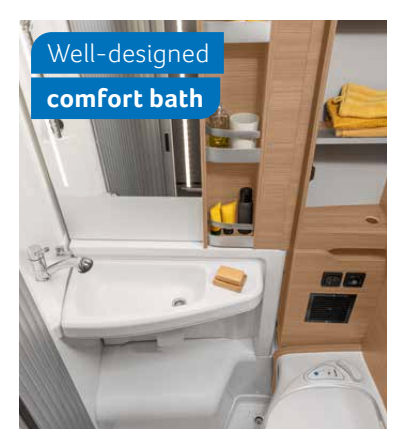
640 MEG. The comfort bath boasts a number of clever features, like the swivelling wall.