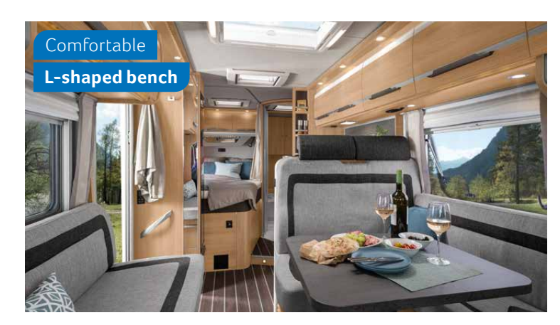
650 MF. Enjoy the ample legroom in the generous seating area thanks to the height-adjustable pedestal table.

State-of-the-art technology meets perfect equipment. The innovative FoldXpand rear construction & intelligent furniture geometry create even more living space.