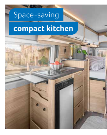
540 ROAD. Practical features and plenty of room for cooking.

630 FREEWAY. Two people can snuggle up in the single beds, while the overhead cabinets provide plenty of storage space.