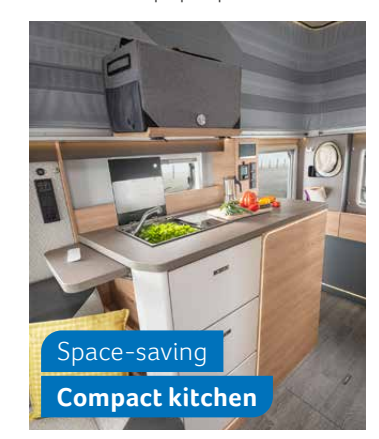
500 LT. Fantastic compact kitchen including compressor fridge and 2-burner hob.